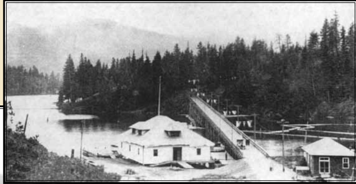
Top: Chautauqa Bridge and Boat house era 1915